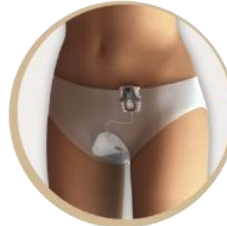
APPLY TO PERINEUM

No training required. Use anywhere, anytime, while doing other tasks. This convenience drives compliance. Use 4 times per week and see results in as few as 6 weeks. It's easy, comfortable, and discreetly worn under clothes.